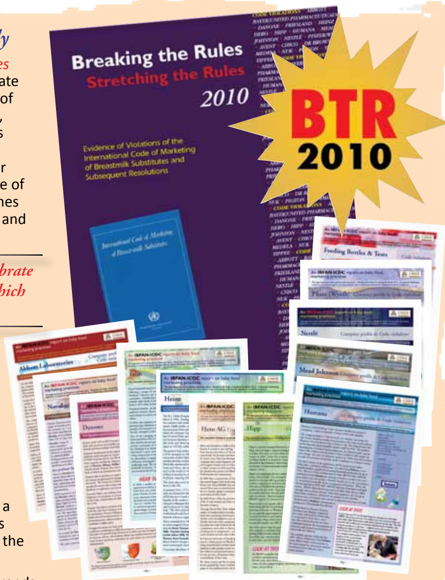
Breaking the Rules, Stretching the Rules 2010 is available on the IBFAN website The Executive Summary, Introduction and Code summary are FREE

Feeding bottles & teats: AVENT • CHICCO • DODIE • DR BROWN • EVENFLO • MEDELA • NUBY • NUK PIGEON • SUAVINEX • TOMMEE TIPPEE